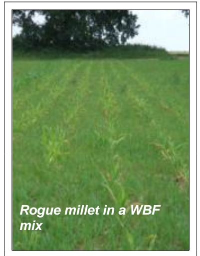
Rogue millet in a WBF mix

Bird Seed mixes, including practical approaches to the control of the invasive rogue millet that has turned up in one of Steve's bird seed areas ( right ).