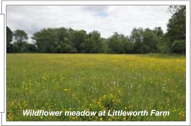
Wildflower meadow at Littleworth Farm