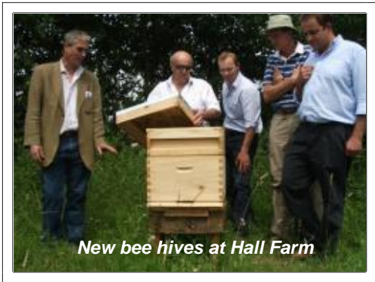
New bee hives at Hall Farm