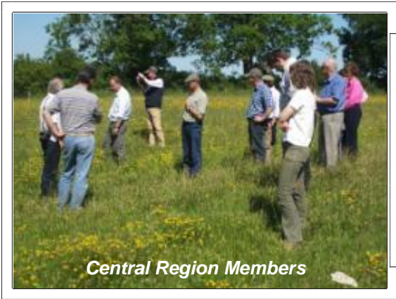
Central Region Members