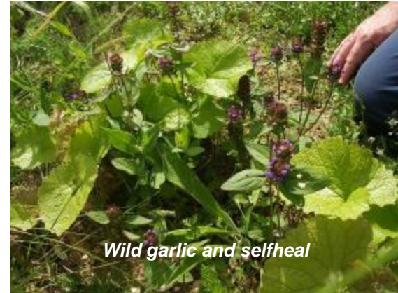
Wild garlic and selfheal

Grass seeds are generally less resilient than wild flowers and decay away more quickly in the soil. As a result what you typically find with spring sowings in dry conditions is that the grass establishment is poor and thin. Amongst this thin open grass the wild flowers germinate sporadically, but finding little competition and having deeper roots are then able to grow unimpeded. This scenario, with the wild flowers having the advantage, can sometimes be quite advantageous towards establishing a good balance of wild flowers.